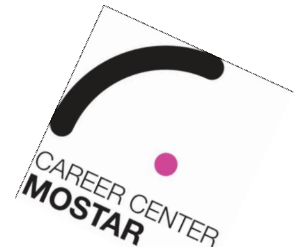
Quality Assurance Office