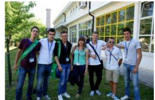
FIT coding challenge

International Summer School in Social Entrepreneurship and Human Rights