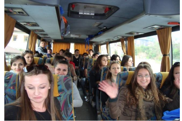
Scholarship fair Sarajevo